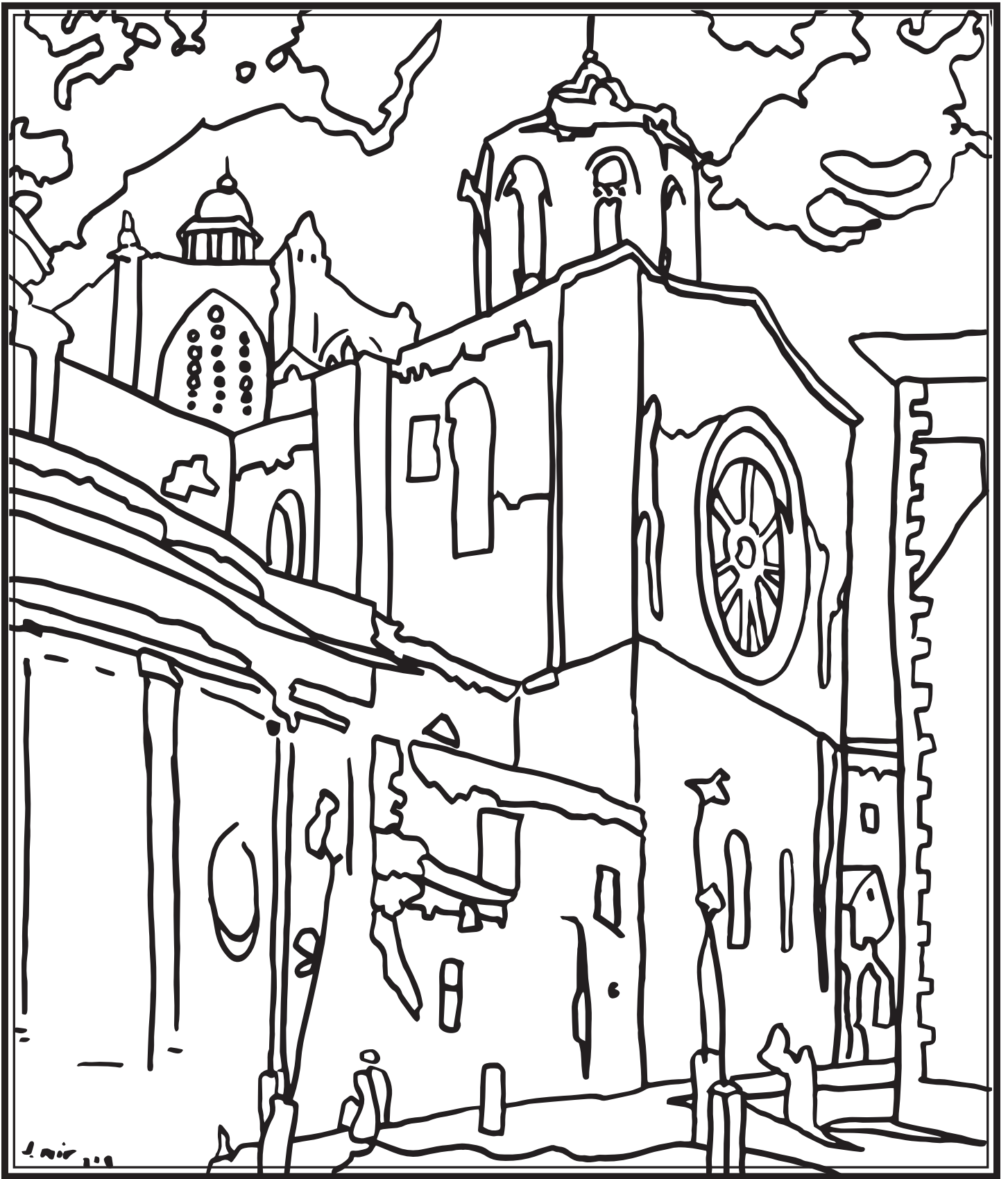
THE LANTERN, CATHEDRAL, TARRAGONA (1928) Joaquín Mir Trinxet (Spanish, 1873 - 1940)