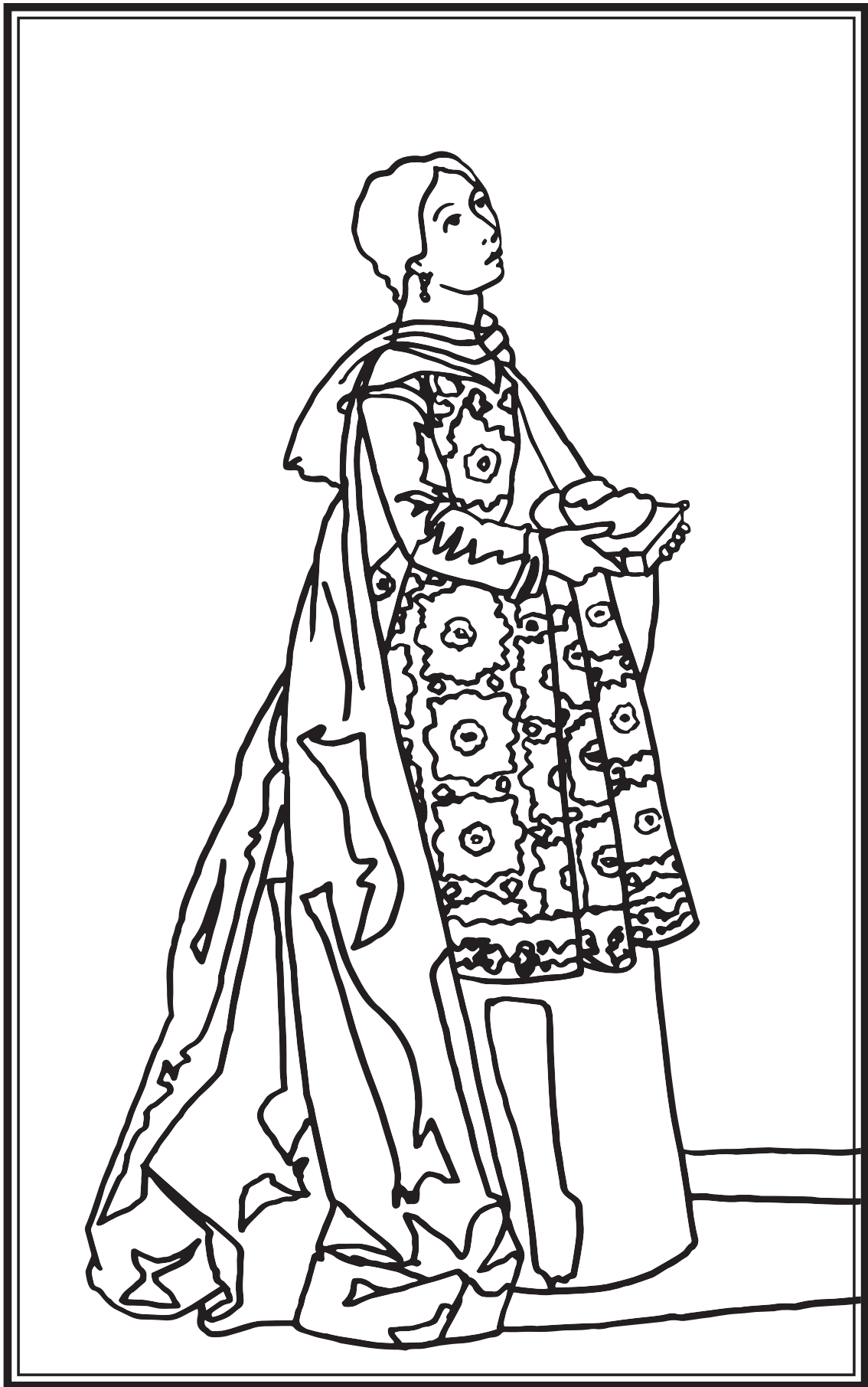
SAINT EMERENCIANA (1635-1640) Francisco de Zurbarán (Spanish, 1598 - 1664)